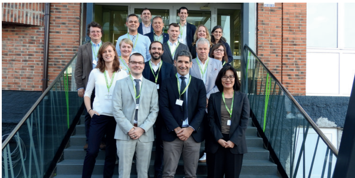
Participants from the BILT Entrepreneurship workshop at TKNKA, San Sebastian, Basque Country, Spain.