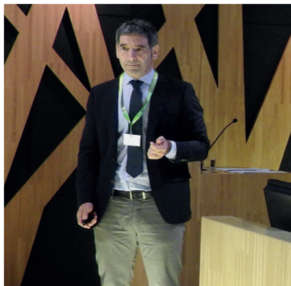
Rikardo Lamadrid, Vice-Ministry of VET, Basque Country/Spain

During the BILT Kick-Off Conference in July 2019, UNEVOC centres had chosen these key issues in response to the need of enforcing an entrepreneurial mind-set and entrepreneurial competencies in TVET. Seen through this lens, BILT attempts to understand how European TVET stakeholders are engaging within the theme to address these challenges and ensure that TVET remains not only relevant now, but positions itself for the future.