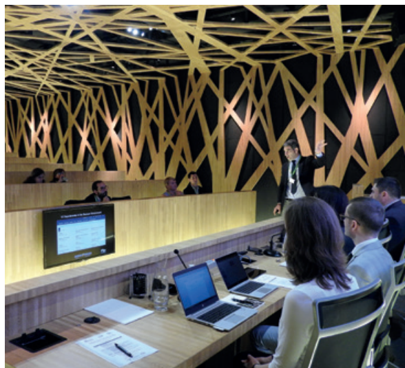
Rikardo Lamadrid, Vice-Ministry of VET, Basque Country/ Spain, leads a session

The problem ILLT addresses is a lack of valuable and quality-assured teaching materials in terms of entrepreneurship and learning-to-learn competencies. The direct target group is TVET teachers, which the tool provides with necessary instruments for entrepreneurial teaching. Completed and released in autumn 2019, currently 54 of 70 VET providers in Lithuania have access to the platform.