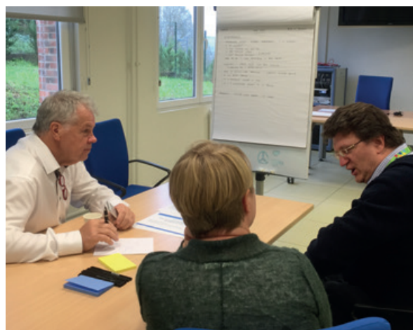
Participants discuss a BILT example during a World Cafe session