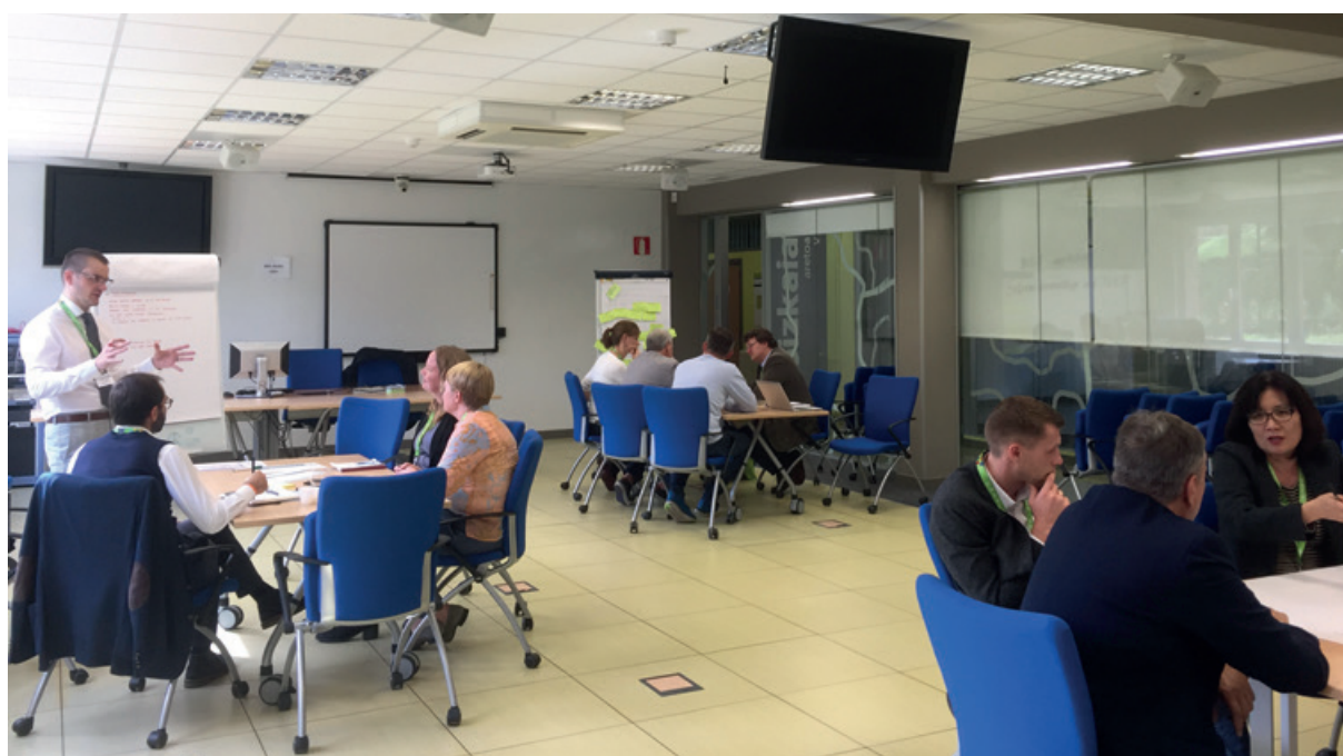
Workshop participants discuss examples during the World Cafe

Participants drew attention to the role and importance of international knowledge transfer and insights into other programmes, as in the BILT workshops. Content-wise, the distinction was made that it was not only important to learn about projects and related challenges, but to also develop solutions together. Future BILT activities will continue to head towards this direction with deeper analysis regarding the different BILT project themes in the framework of expert's groups. Analysing the extent to which different countries have included entrepreneurship as business education or cross-cutting competence in their curricula and comparing the type of content was mentioned as an interesting option for future BILT activities.