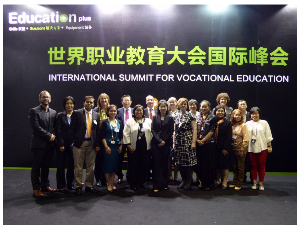
Participants of the 2nd Regional BIBB Partners Meeting Asia-Pacific 2016